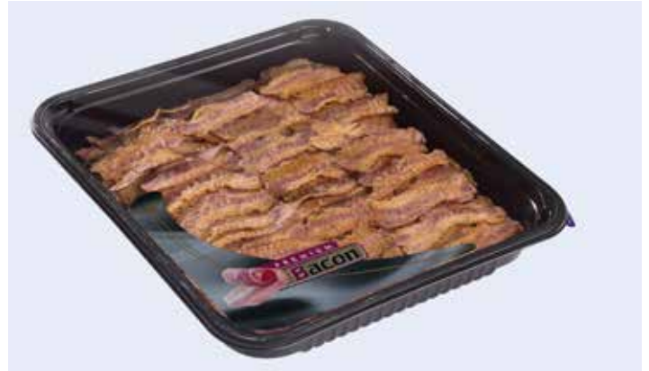
Premium bacon specialties: raw bacon slices and dices, cooked bacon slices and dices, crispy bacon slices and dices, bacon on parchment paper