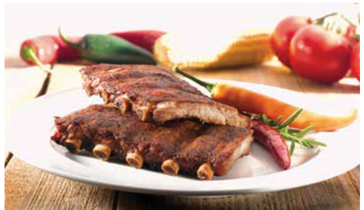
Pre-cooked products: tender Spare ribs cooked Sous-Vide, minced meat seasoned and made to Granny's recipe, handmade roasting skewers with various seasoning.