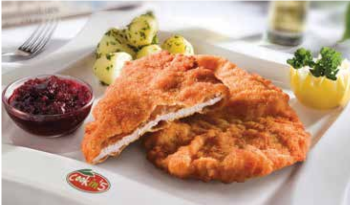
Just breaded - convenience-products like homemade: Viennese veal escallops, chicken-/turkey-/pork-/veal-/vegetable specialties