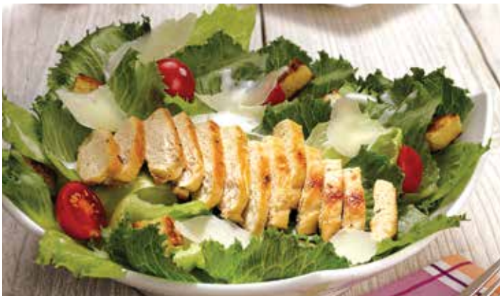
Just roasted: Chicken- or turkey- breast, inner filet or thigh meat, pork filet or loin.