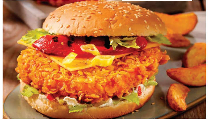
Chicken specialties: crunchy chicken burger, crunchy chicken cutlet, chicken cordon bleu, chicken popcorn, chicken wings, chicken filet skewer, chicken breast cooked in all forms and slices, etc.