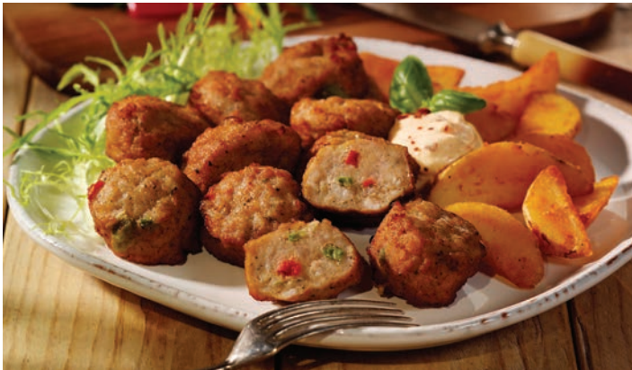
Mincemeat specialties: stuffed pepper bells, bifteke, cevapcici, liver dumplings, mincemeat balls, meatballs, minced beef steak, meatloaf, etc.