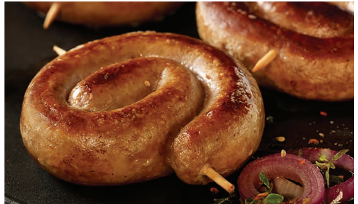
Sausage and meat specialties: beef bratwurst, pork and chicken bratwurst, wiener, beef cheeks, calf spare ribs, beef goulash, etc.