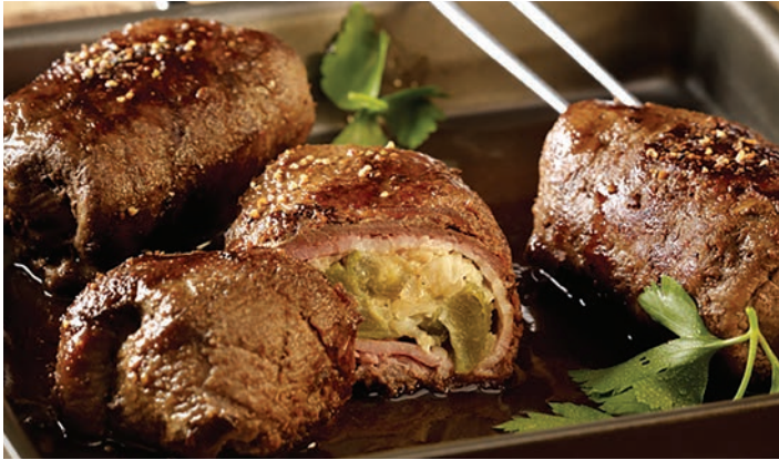
Roulades: Various beef-, pork-, cabbage- & chicken roulades